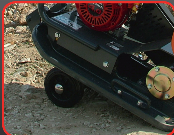
Wheel Kit Option Available