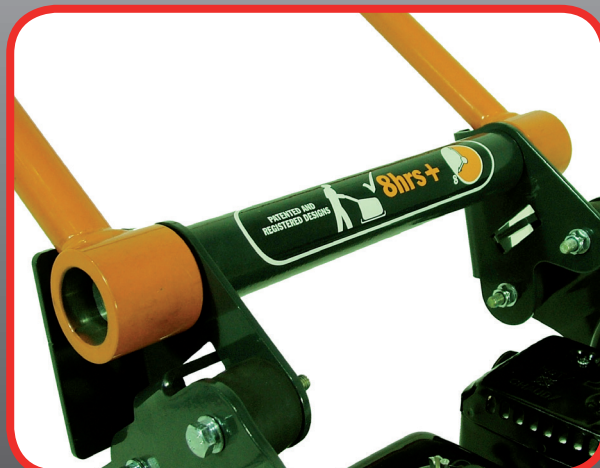
Unique Low HAV Mounting System